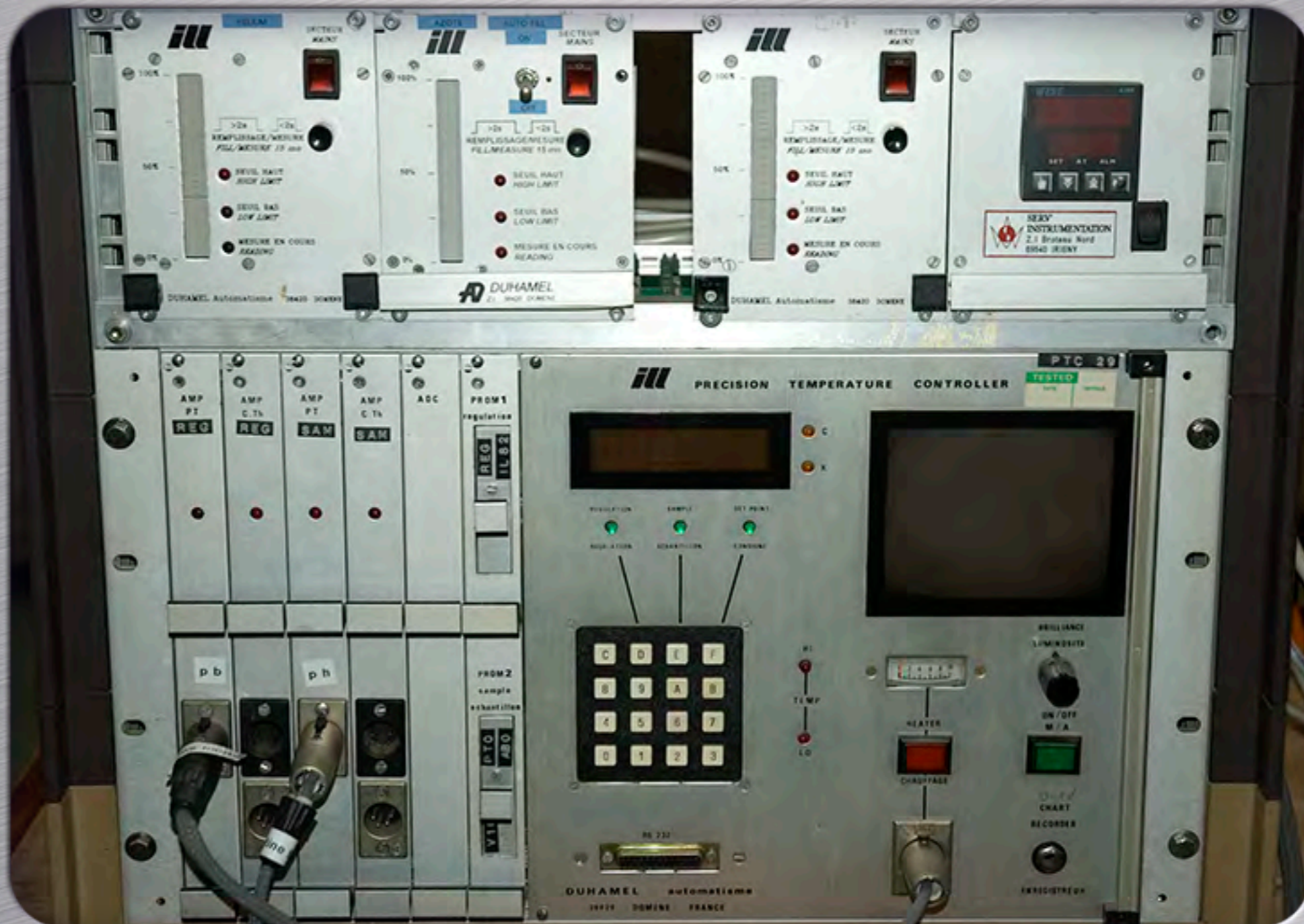
Cryostats electronics - 1 st generation